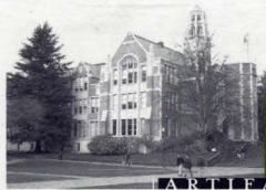
ARTIFACTS Spring 2002