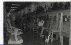
Industrial Design furniture projects lining the corridors of the SOA

A computer-animated short entitled The Art of Survival , co-created by several art students in CSE 458/490 last Spring, was recently accepted into the Official Competition of the 1998 Ottawa International Animation Festival - one of only 80 films chosen from the more than 1,200 entries received this year. This announcement follows on the heels of the short film's acceptance into next year's Spike & Mike Animation Film Festival, where it will share the stage with Pixar's animated short Geri's Game and work by Aardman Animations of Wallace & Gromit fame.